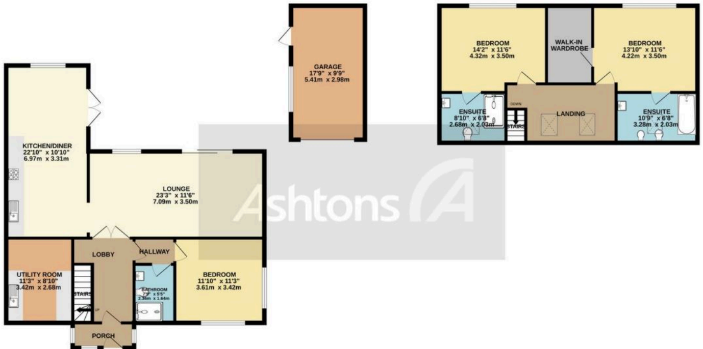
1ST FLOOR 619 sq.ft. (57.5 sq.m.) approx.

TOTAL FLOOR AREA : 1718 sq.ft. (159.6 sq.m.) approx.