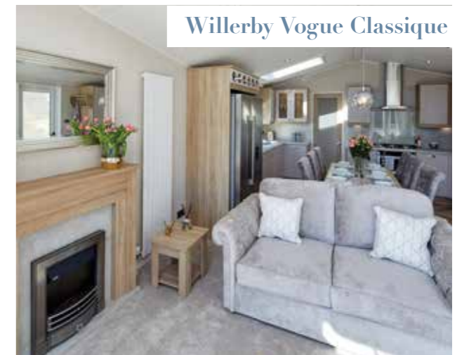
Willerby Vogue Classique

Style, substance, space, the ABI Westwood has got it all. From striking wood feature walls to statement radiators, its design details break the mould.