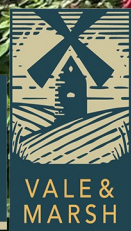
5 Windmill Cottages Cranbrook, Kent TN17 2ET