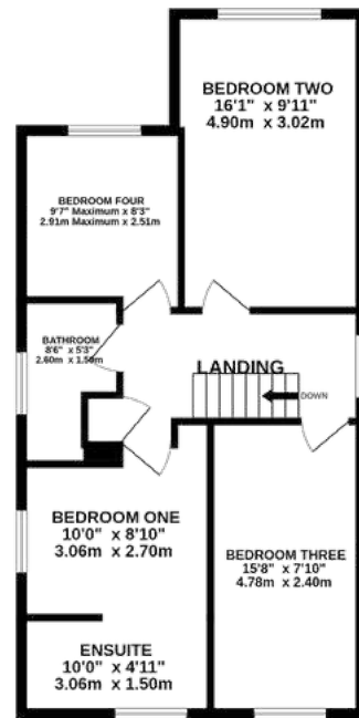
1ST FLOOR 618 sq.ft. (57.4 sq.m.) approx.