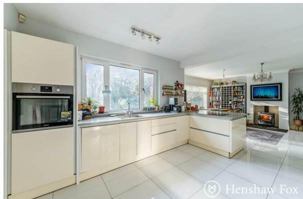
Forest Corner, 153 Woodlands Road | Ashurst, Southampton, Hampshire, SO40 7BH