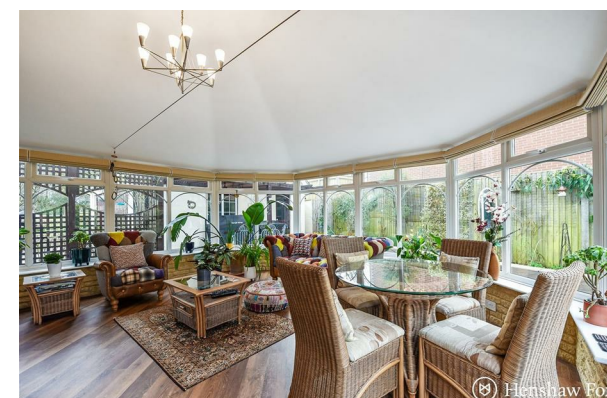
Peartree Cottage | £950,000 Forest Road, Nomansland, Wiltshire, SP5 2BN