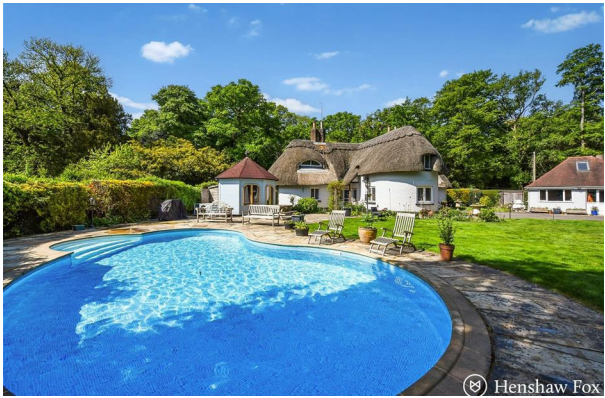
The Round House | £850,000 Shootash, Hampshire, SO51 0GB