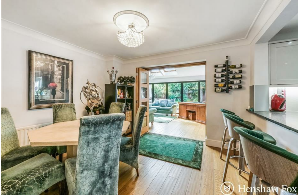
Oaktrees Sandy Lane | £895,000 Romsey, Hampshire, SO51 0PD