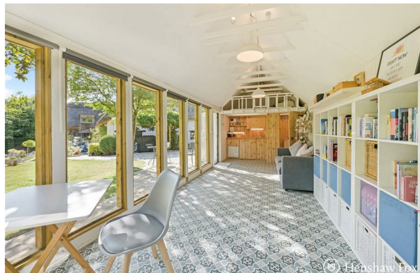
Elizabethan Cottage | £1,595,000 Chapel Lane, Timsbury, Hampshire, SO51 0NW