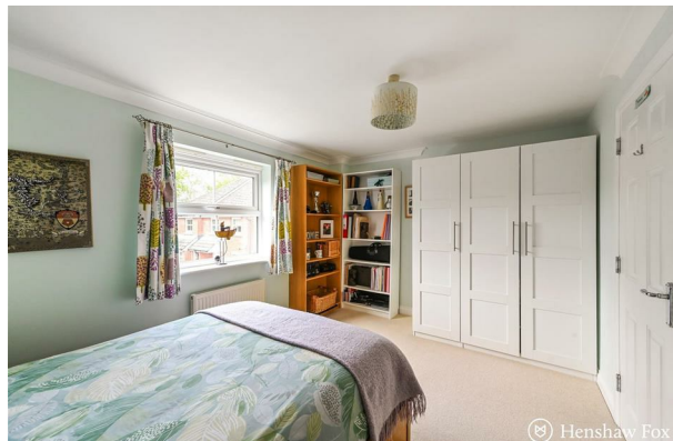
43 Withy Close | £425,000 Romsey, Hampshire, SO51 7SA