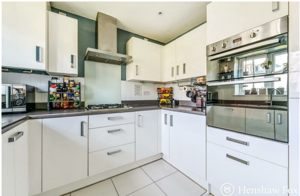
43 Lawes Walk | £385,000 Romsey, Hampshire, SO51 0BZ