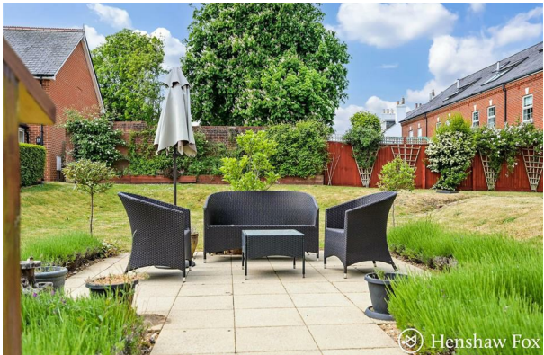
4 Abbey Lodge | £185,000 Bridge Road, Romsey, Hampshire, SO51 8LJ