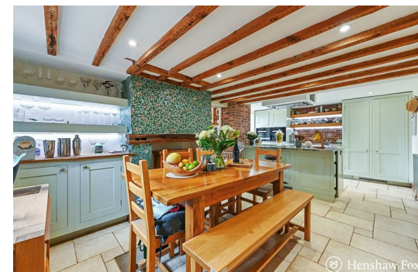
Meadowview Cottage & The Smithey | £725,000 f3 Romsey Road, Ower, Romsey, SO51 6AF