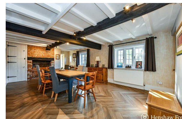
The Hawthornes | £1,499,500 Cowesfield, Whiteparish, Wiltshire, SP5 2QZ