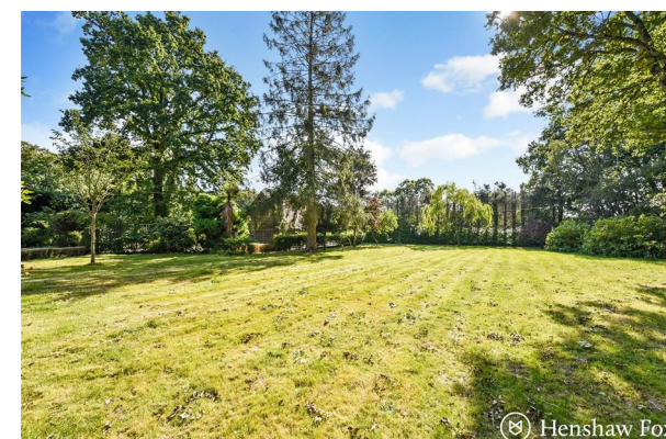
Giggleswick Cottage | £950,000 Salisbury Road, Ower, Hampshire, SO51 6AN