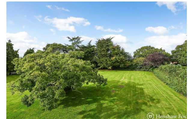
Highwood Farmhouse | £1,000,000 Highwood Lane, Romsey, Hampshire, Hampshire SO51 9AG