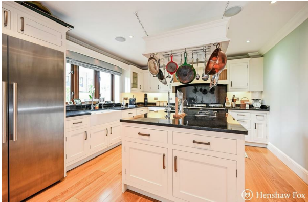
5 Linden Gardens | £1,400,000 Romsey, Hampshire, SO51 8JY