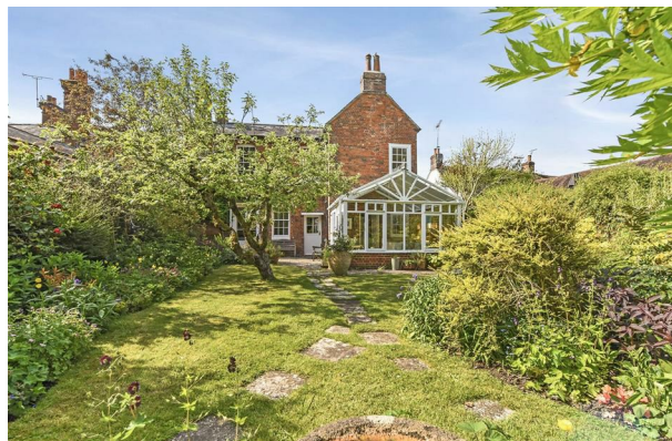
Clarendon House | £950,000 60 Middlebridge Street, Romsey, Hampshire, SO51 8HJ