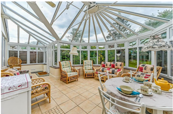
281 Woodlands Road | £500,000 Woodlands, Hampshire, SO40 7GE