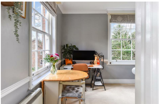
22 Montfort College Botley Road | £220,000 Romsey, Hampshire, SO51 5PL