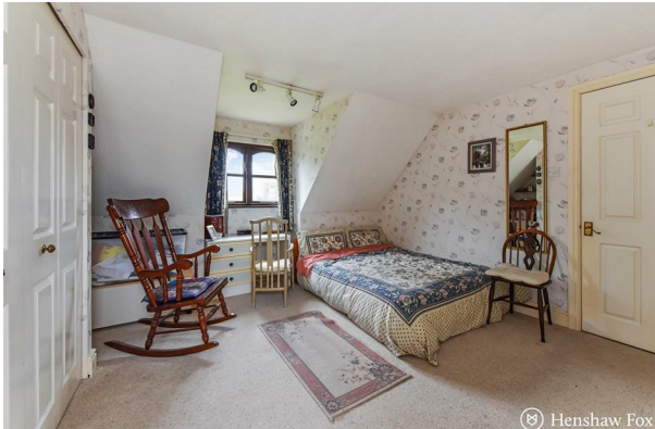
Oakwood | £695,000 Stockbridge Road, Timsbury, Hampshire, SO51 0NF