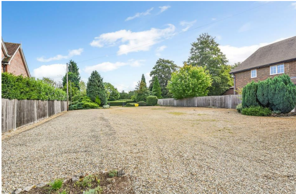
Kingdom Hall Stockbridge Road | £495,000 Timsbury, Romsey, Hampshire, SO51 0NG