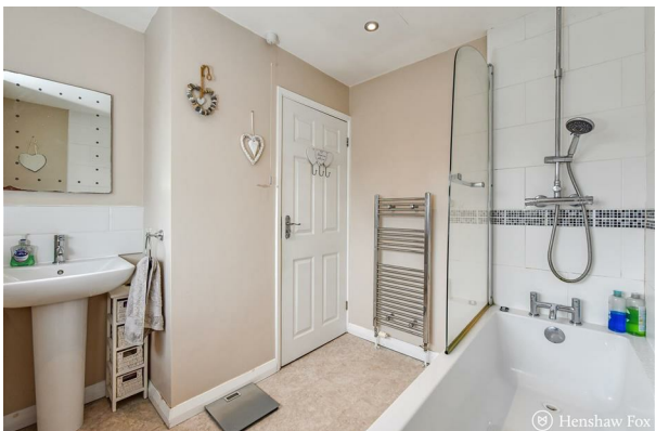
103 Ringwood Drive | £365,000 North Baddesley, Hampshire, SO52 9GR