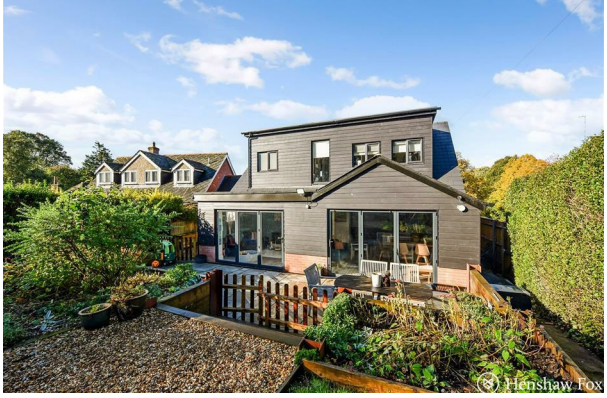
Meadow View | £650,000 6 Cupernham Lane, Romsey, Hampshire, SO51 7JH