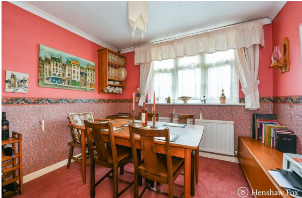
9 St. Christophers Close | £349,000 North Baddesley, Hampshire, SO52 9NZ