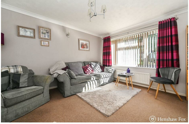
31 Tavistock Close | £375,000 Romsey, Hampshire, SO51 7TQ