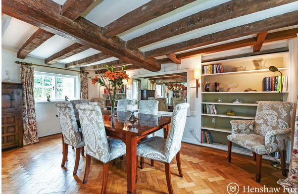
Old Roost Cottage, Branches Lane | £1,175,000 Sherfield English, Romsey, Hampshire, SO51 6FH