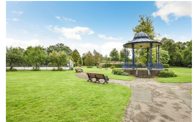
3 Rivermead House | £495,000 The Meads, Romsey, Hampshire, Hampshire, SO51 8HY