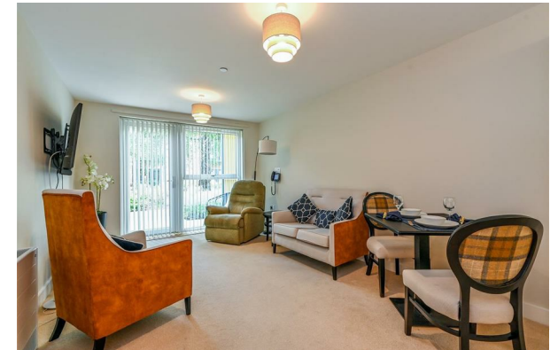
Nightingale Lodge Great Well Drive | £262,500 Romsey, Hampshire, SO51 7AH