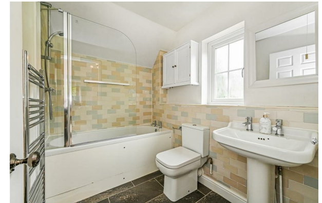
Corner Cottage 18 Meredun Close | £425,000 Hursley, Winchester, Hampshire, SO21 2JB