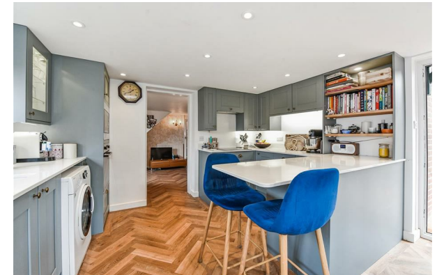
Woodlands Lodge Cottage | £780,000 Woodlands, Hampshire, Hampshire, SO40 7GN