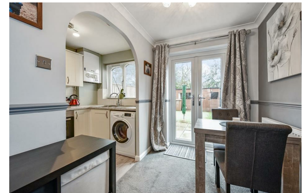
32 Ennel Copse | £280,000 North Baddesley, Hampshire, SO52 9LB