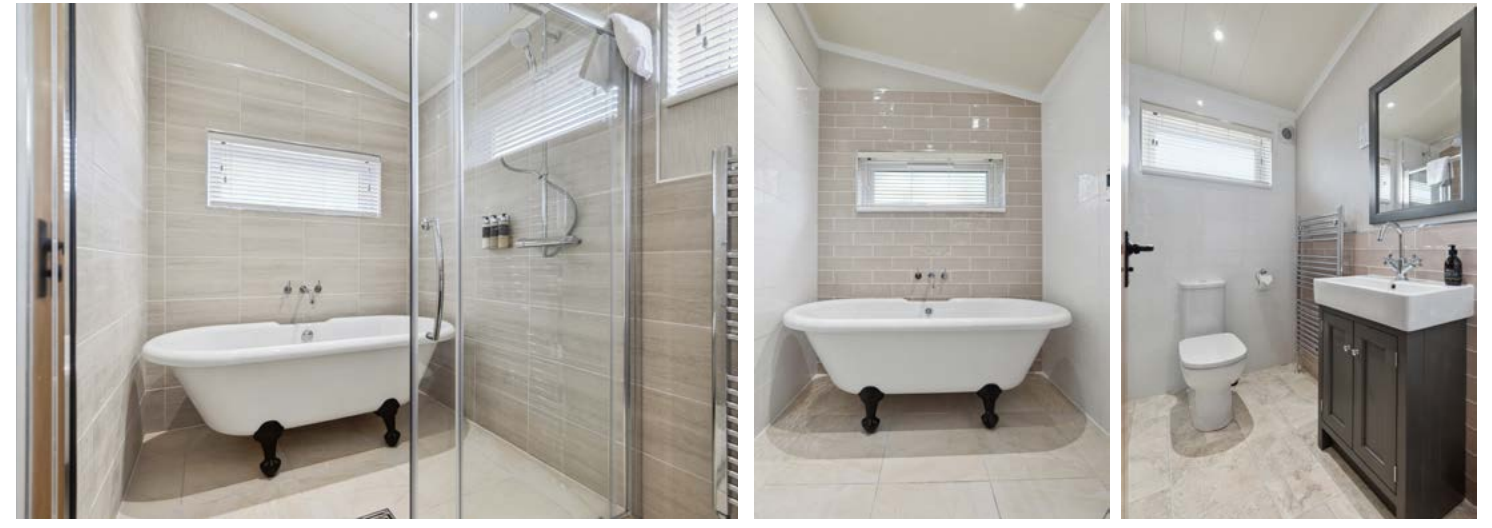
clydeproperty.co.uk | page 9