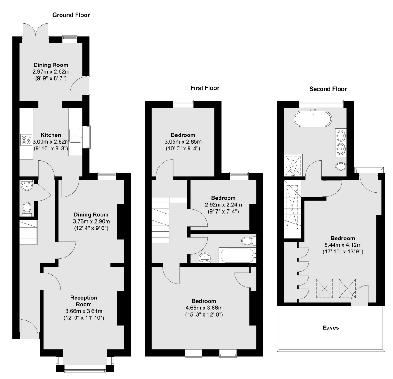
Total area (approx.): 128.8 sq. m (1386 sq. ft) (Excluding Eaves)

Snellers St. Margarets Sales 36 Crown Road St Margarets TW1 3EH 020 8892 8008 stmargaretssales@snellers.co.uk