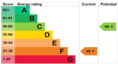
The graph shows this property's current and potential energy rating.