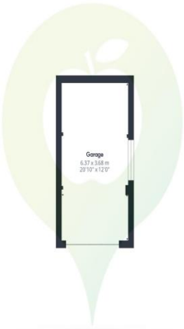
Floor 1 Building 2