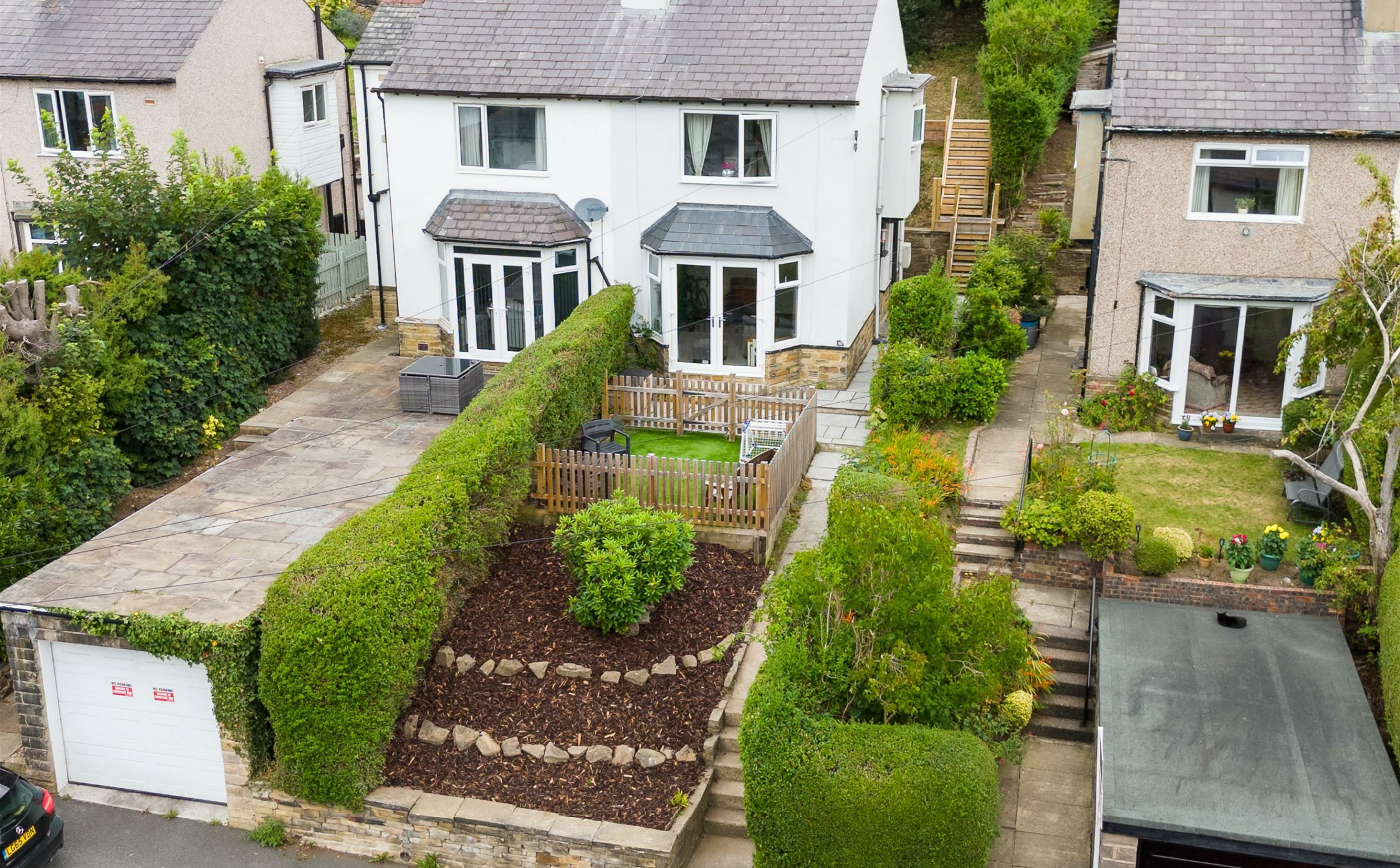
Sunnybank Crescent, Greetland, HX4 8ND £200,000