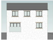
North Elevation Scale 1:100