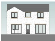
South Elevation Scale 1:100