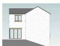
East Elevation Scale 1:100