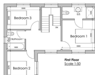
First Floor Scale 1:50