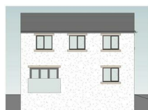
North Elevation Scale 1:100