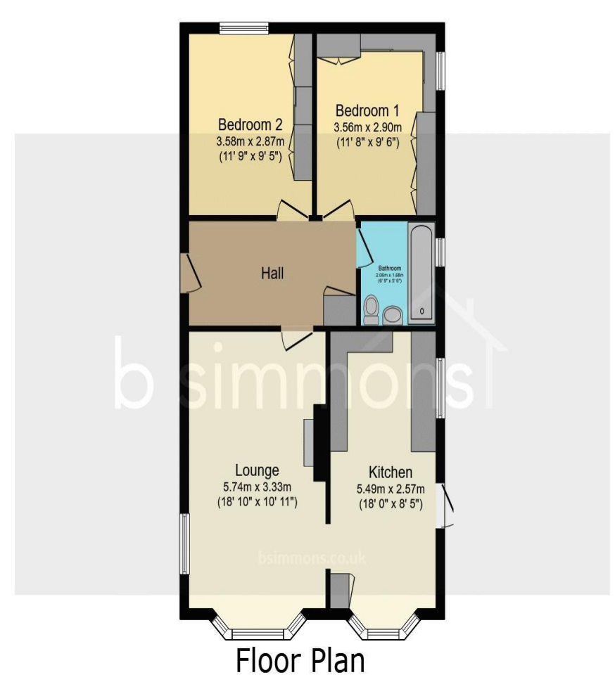
Floor area 68.5 m<sup>2</sup> (738 sq.ft.)