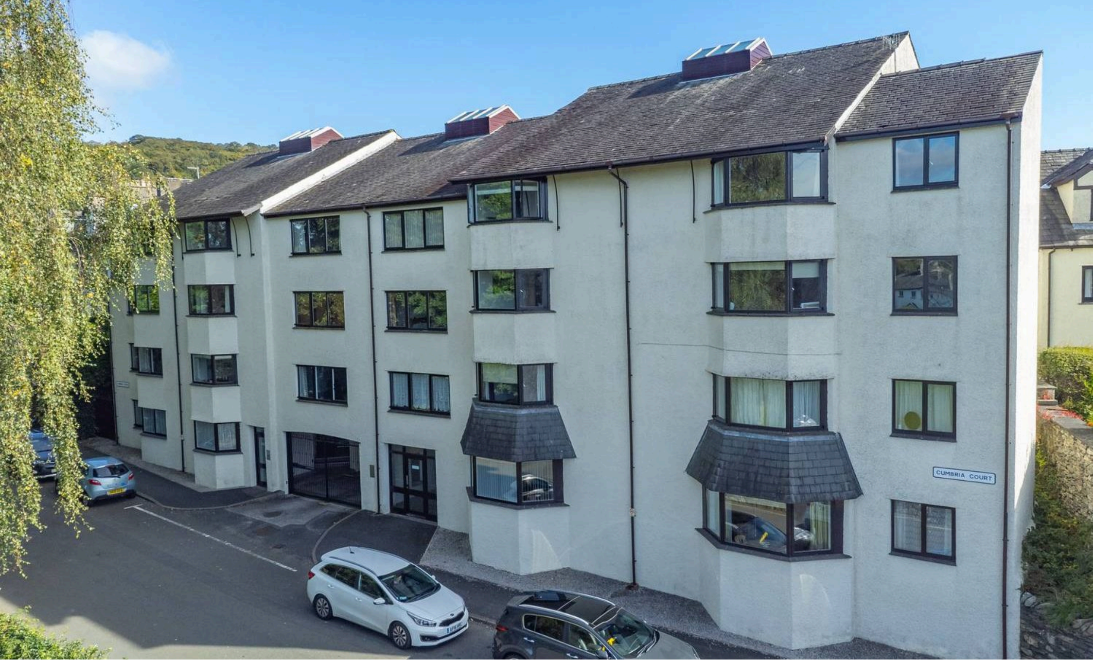
18 Cumbria Court College Road, Windermere £215,000