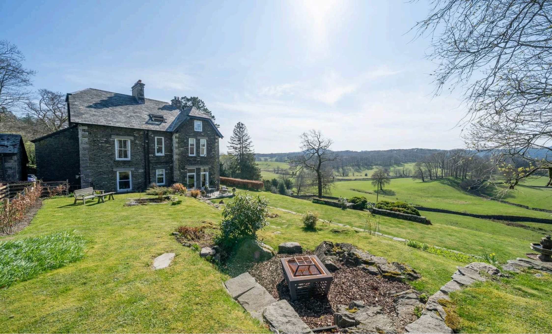
5 The Old Vicarage, Far Sawrey £350,000