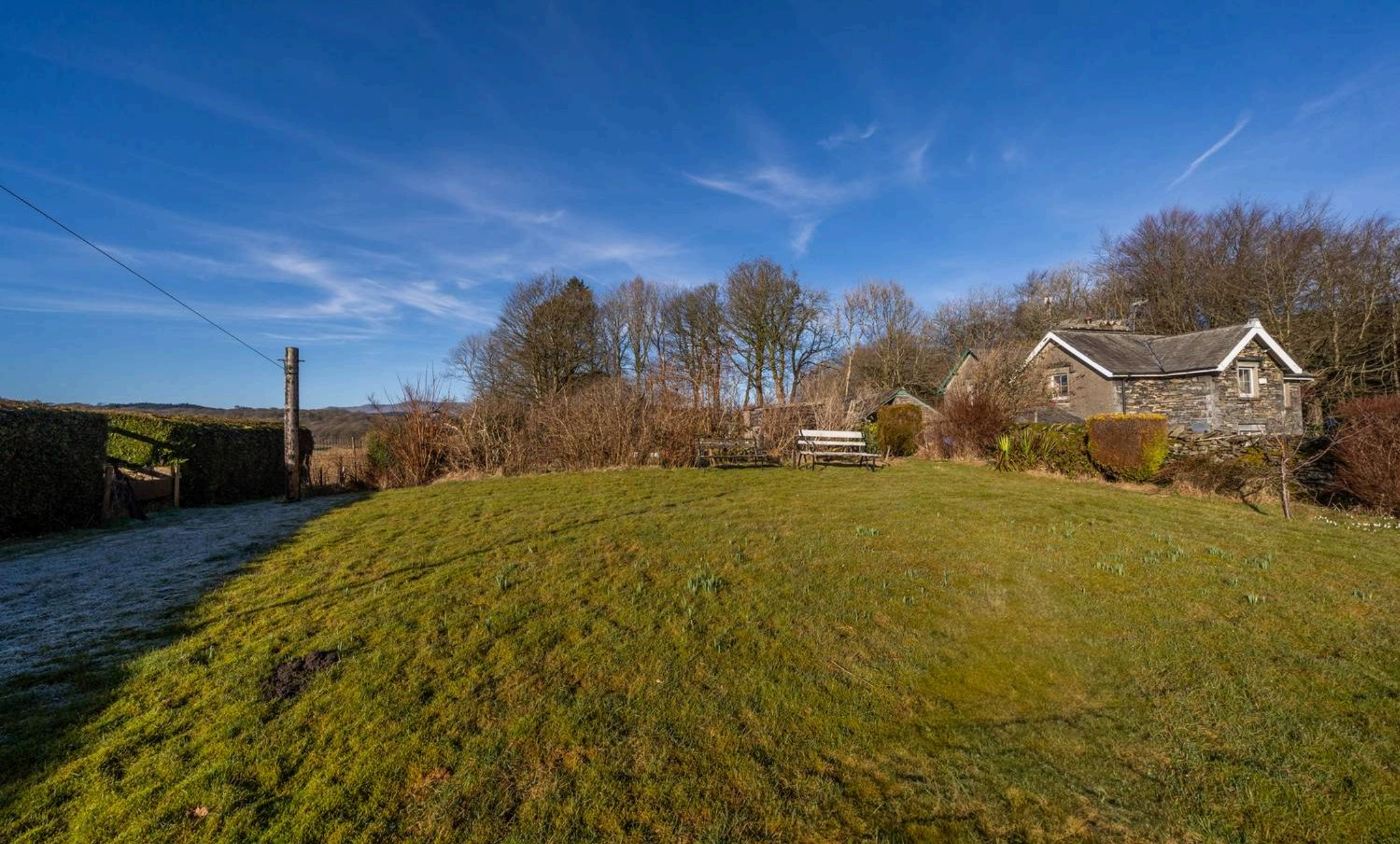
1 Bryers Brow, Far Sawrey £495,000