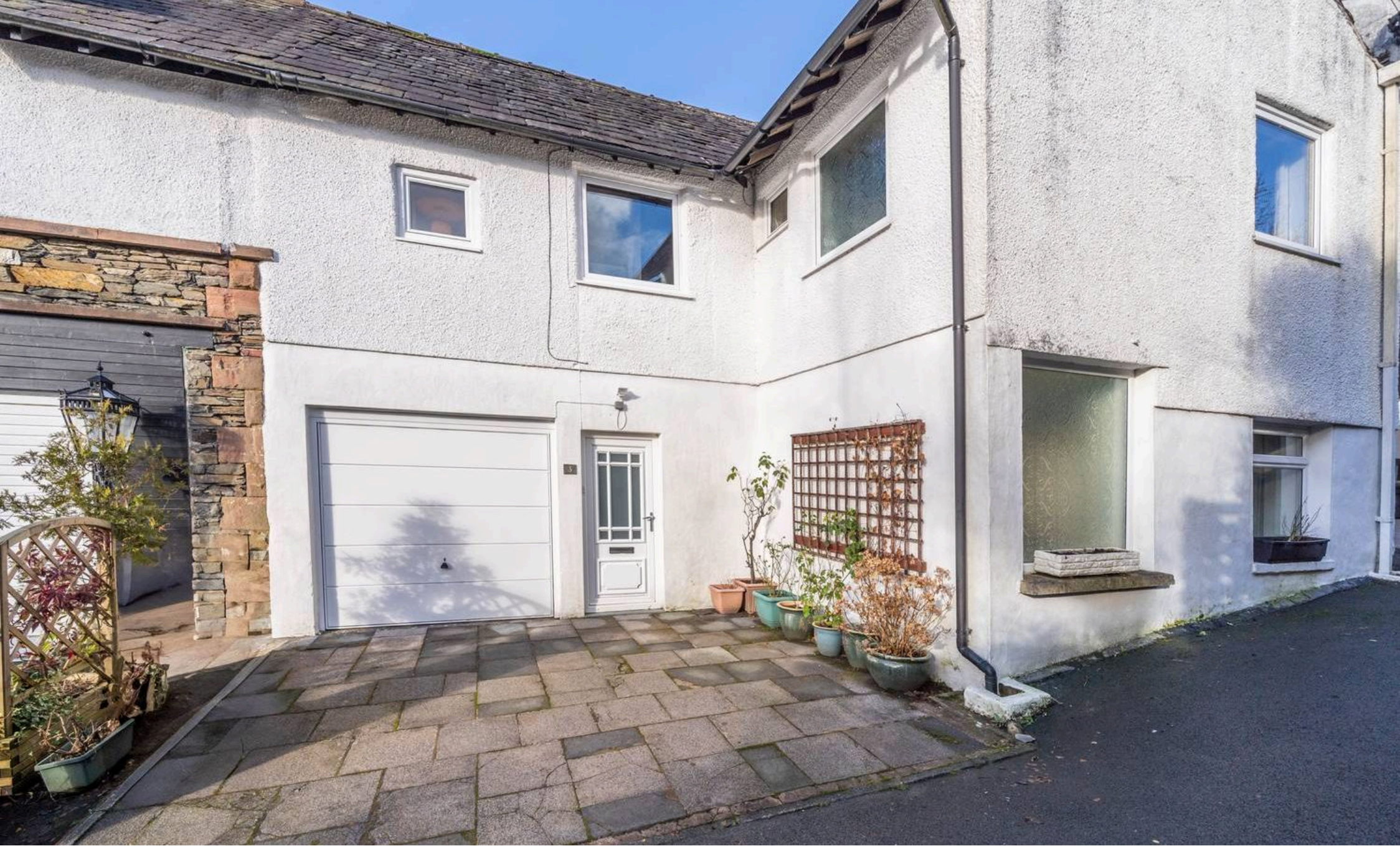
3 Gable Mews College Road, Windermere £375,000