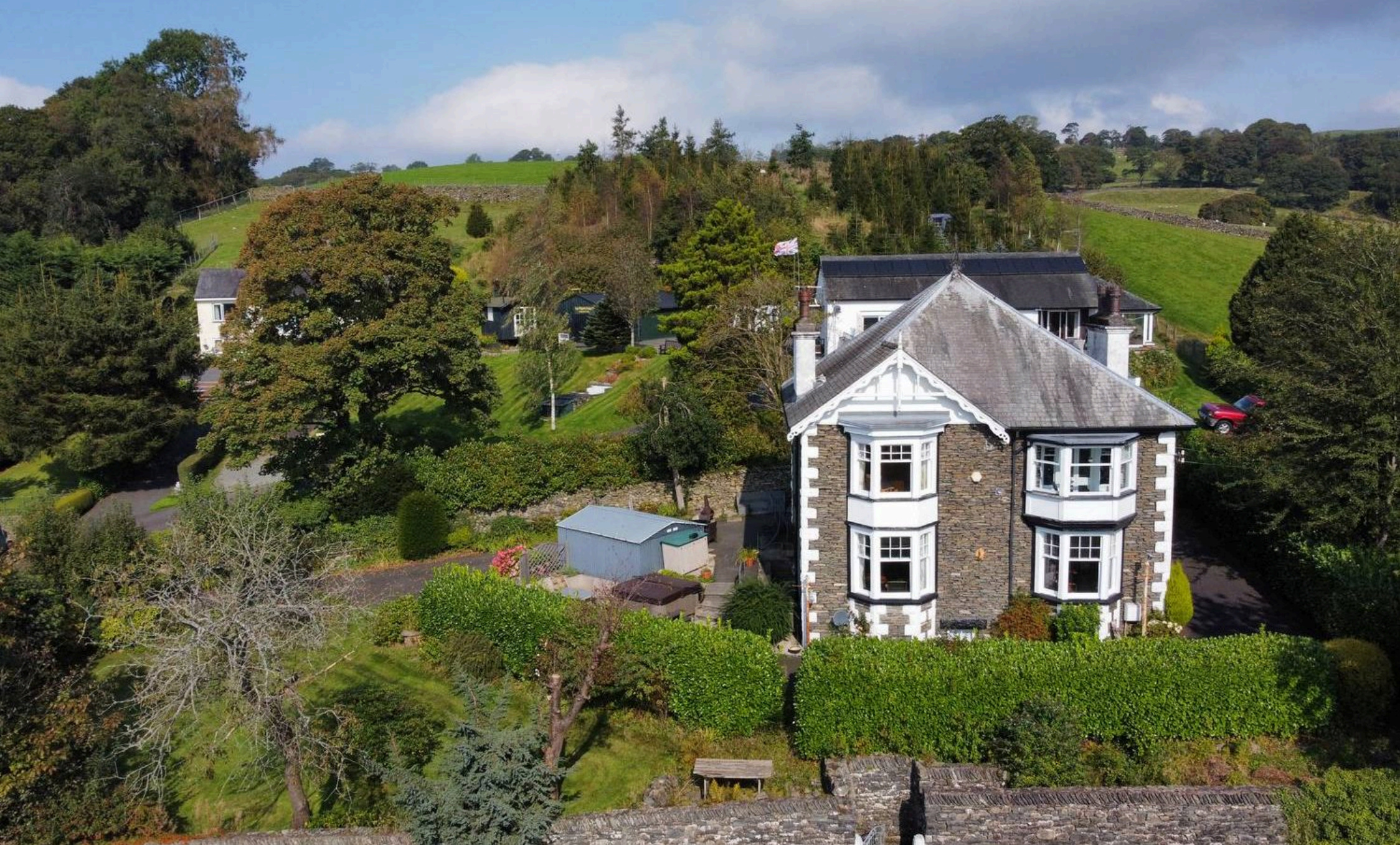
Bankfield, Ings £880,000