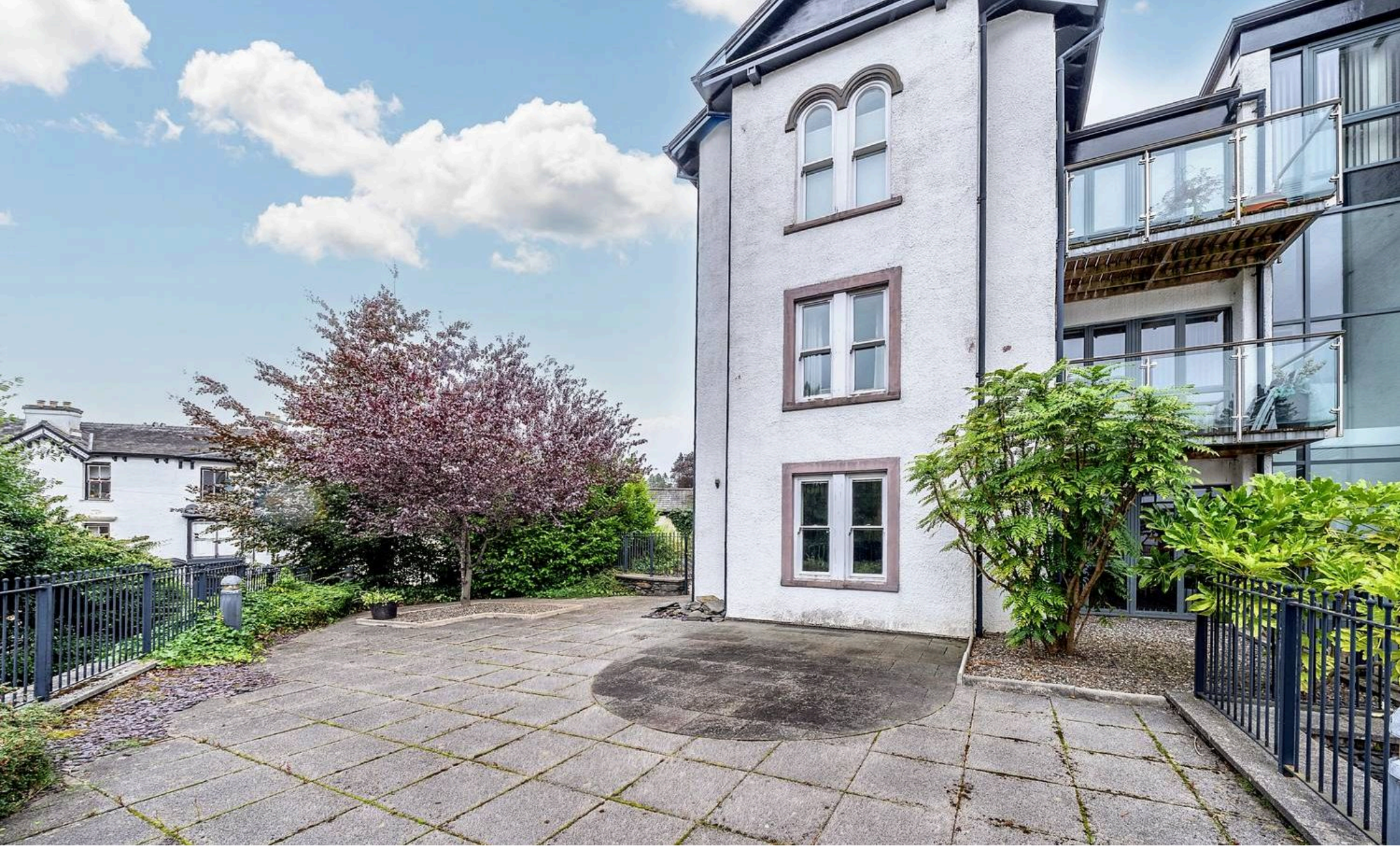
Apt 1, The Royal Church Street, Bowness-On-Windermere £399,950