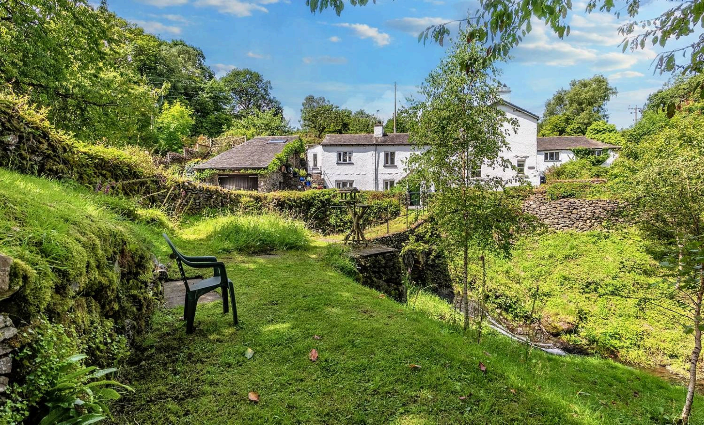
Lound Cottage, Cartmel Fell £550,000