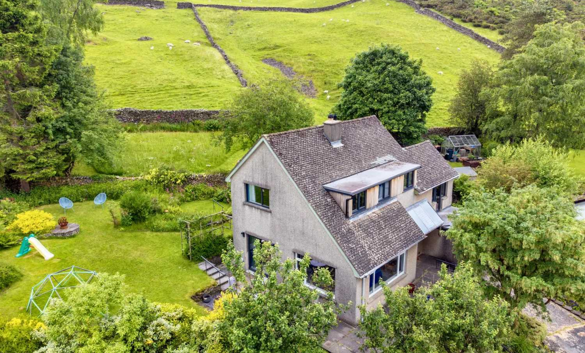
Conifers Seed Howe, Staveley £625,000