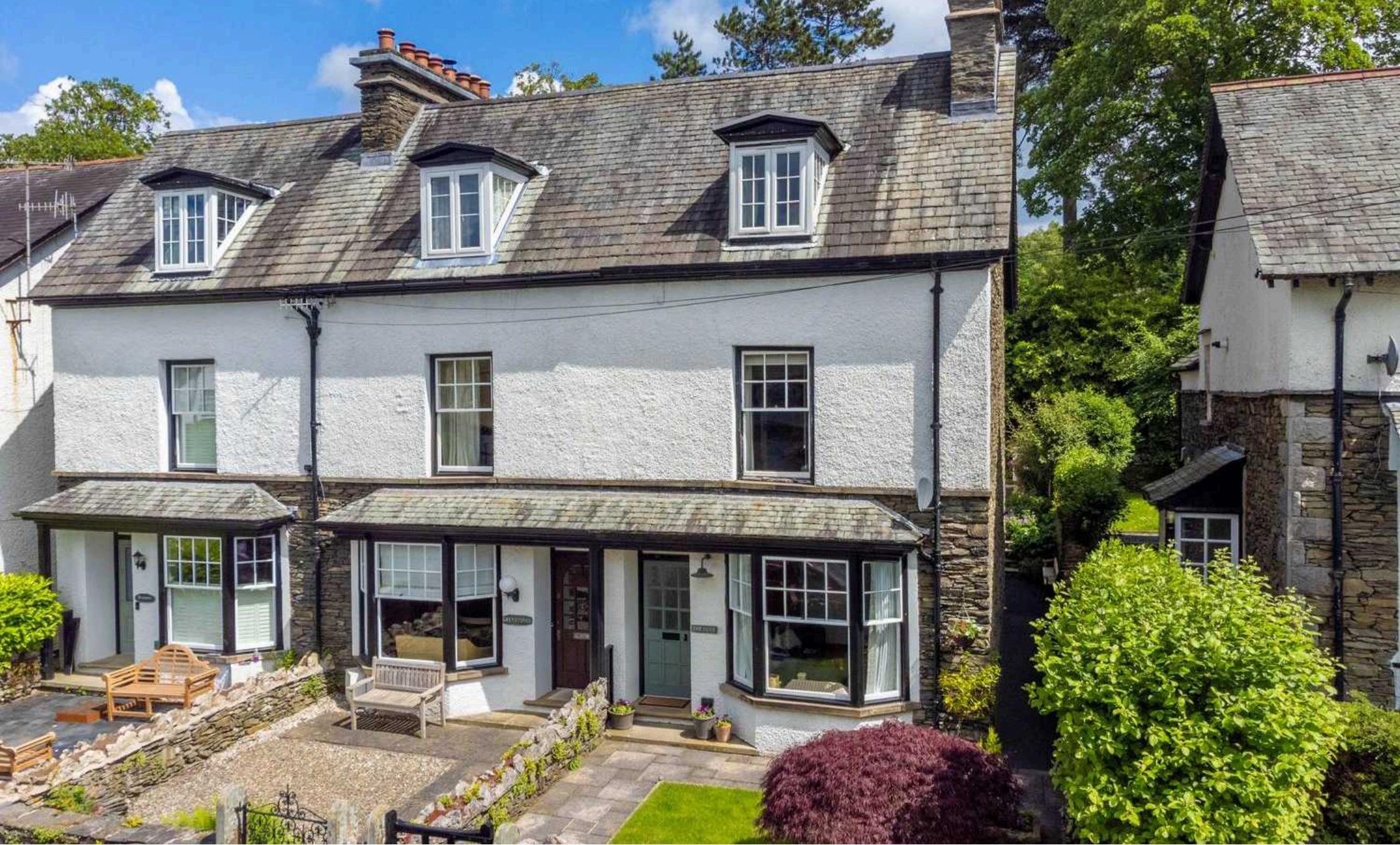
The Cote Beresford Road, Windermere £560,000