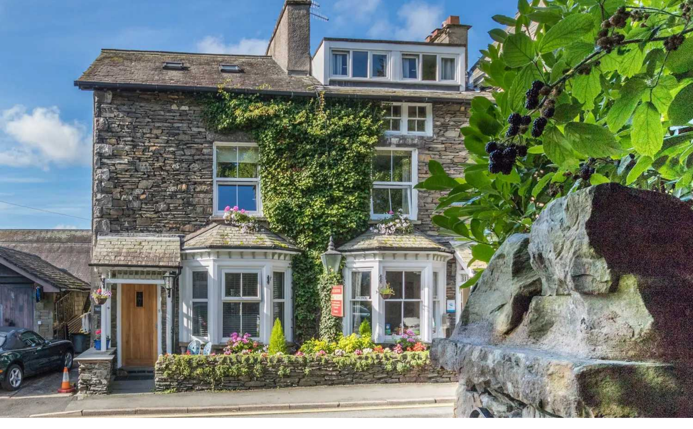
Willow Cottage, Biskey Howe Road, Windermere Offers in Region of £550,000